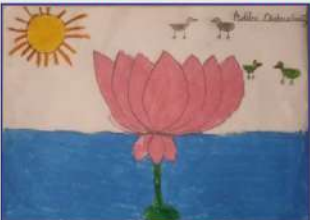
Aditri Chakraborty 4 B