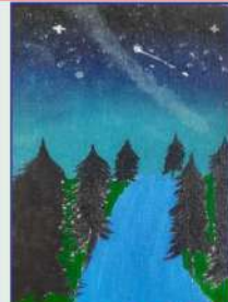
Druv S, 5 E