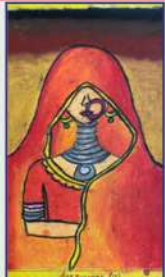
Sai Inchara 4 B