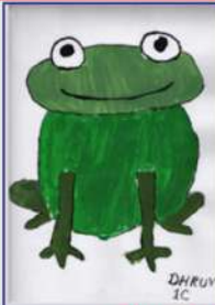
Dhruv, 1 C