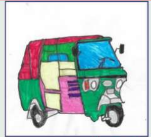
Shanav, 2 A