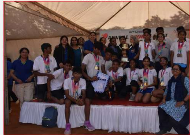
ANNUAL SPORTS MEET 2024-25

"Sports inculcate discipline and endurance in a person."