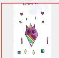
Ruthvi, 2 E