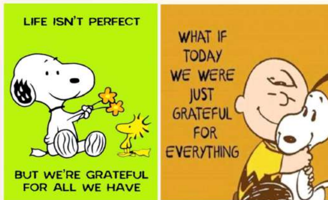
Values Plus team

What are the simple pleasures of your life?