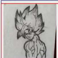
Rishaan E, 3D