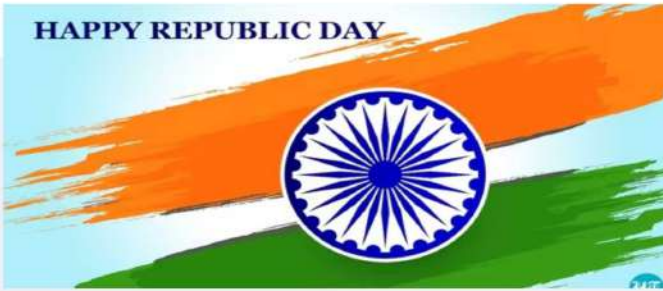
HAPPY REPUBLIC DAY