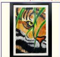
Sloka N, 4E