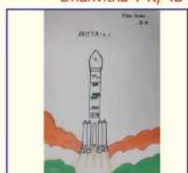
Vishnu Satish, 5E