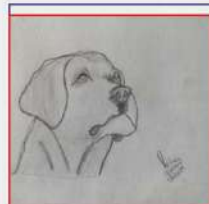
Rishaan E, 3D