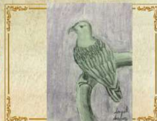
"The Watchful Sentinel"