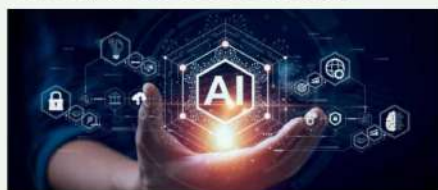
Values Plus Team

AI is not harmful — the unmindful use is. The key lies in balance, responsibility, moderation, and keeping human curiosity at the core of learning.