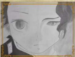
"A Tale of Two Faces"