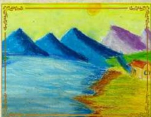
"Sunrise by the Hillside"