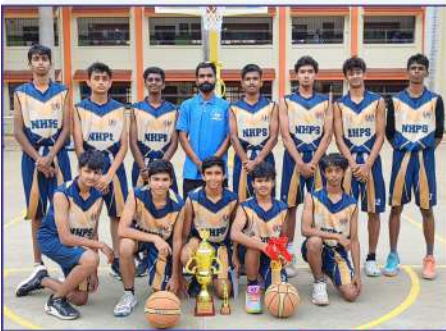
NHPS Under-16 Basketball Team

⚽️ TCL U-10 Football Tournament – Helped PEPS Sports School lift the trophy – a true team player!