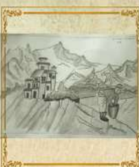
Sheikh Ayaan, 6