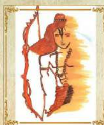
Ketan Yedehalli, 6