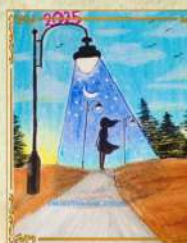
Arnab Agarwal, 5